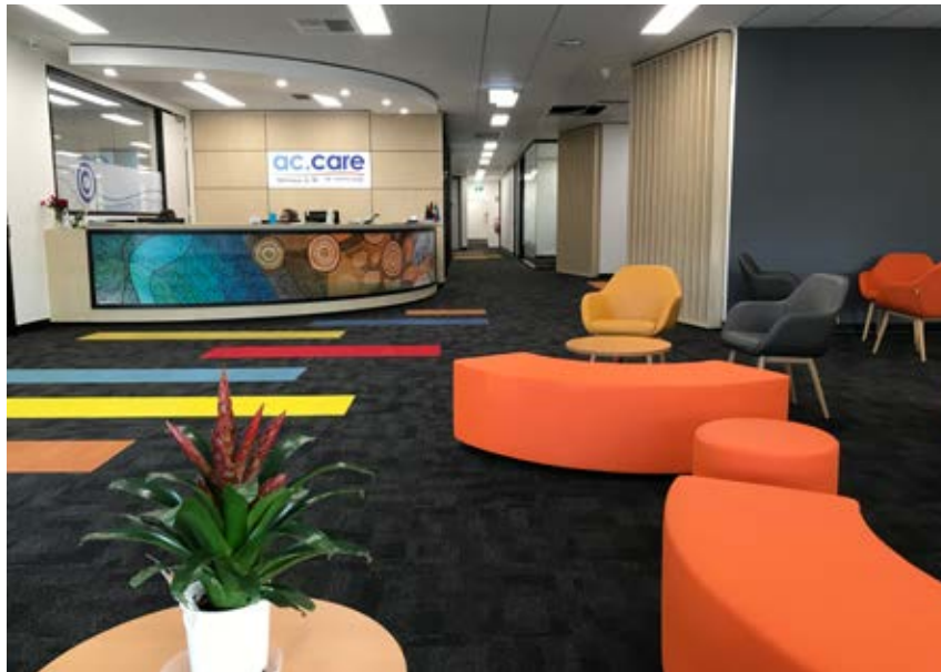
NEW LOOK: The welcoming entrance to the new ac.care Murraylands Centre.