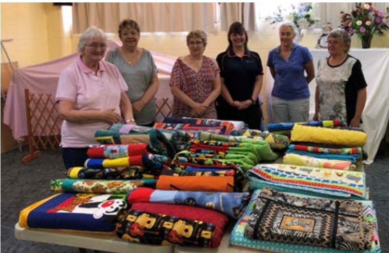
CRAFTY CONTRIBUTION: The Refresh and Bloom group in the Riverland was among community craft organisations to support ac.care, donating hand-made gender and age specific quilts for children in care.

EVENT RAISES FUNDS: The 2019 Mount Gambier Family Truck Show committee donated $4500 to ac.care to support emergency accommodation services and boost our Christmas appeal after the successful community event.