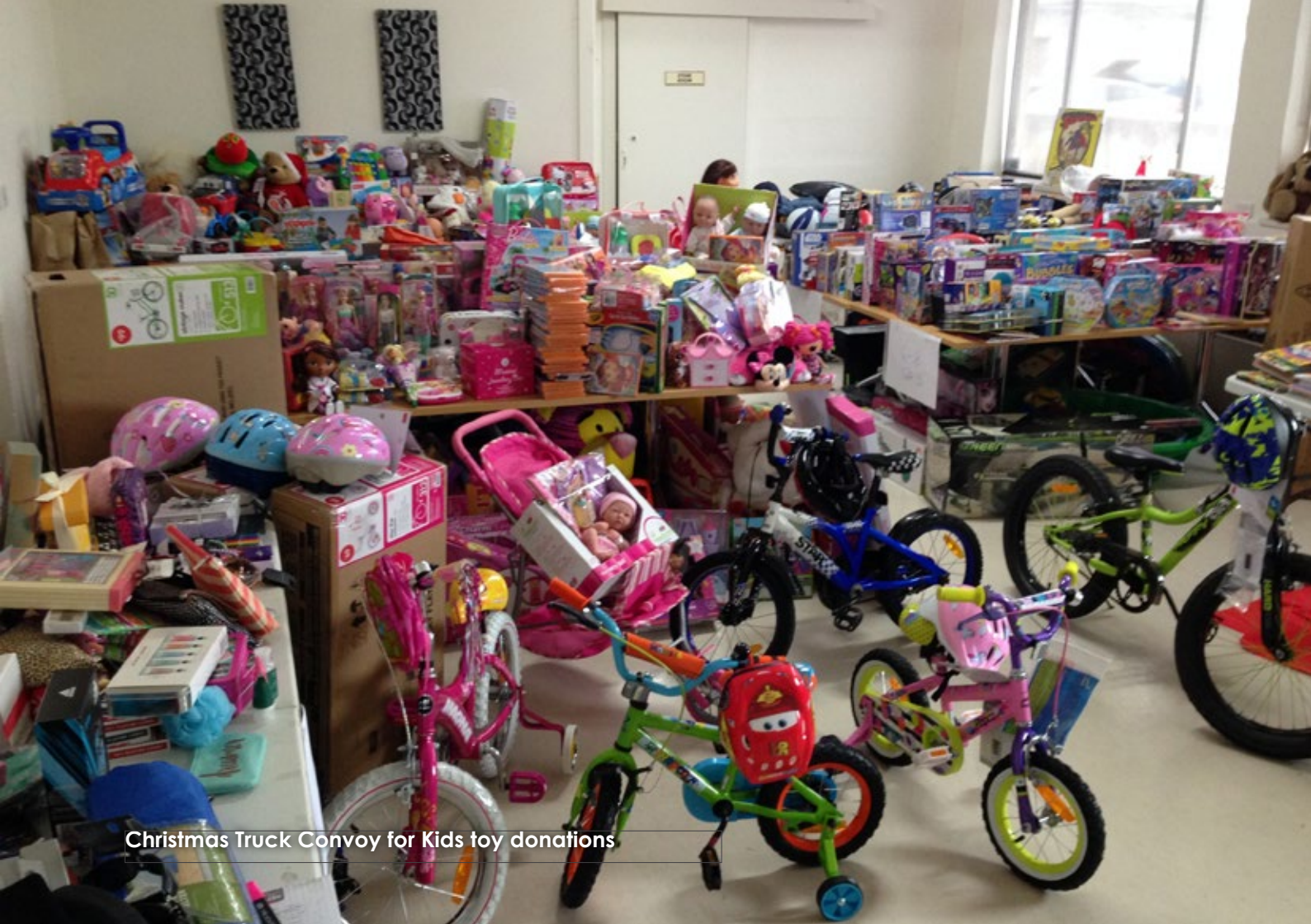
Christmas Truck Convoy for Kids toy donations