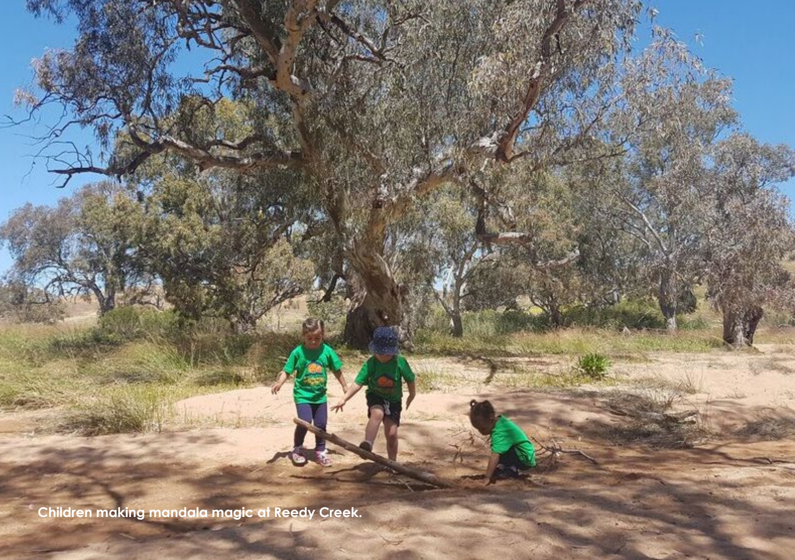
Children making mandala magic at Reedy Creek.